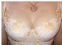
After: D'Elegance Lingerie with double layer tulle cutting at the sides shape the accumulated and excess fats around the underarms and the back towards the center of the cups, leading to a fuller bust.