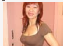
After: D'Elegance Lingerie, with somatological cutting techniques help to lift the breasts to a perfect bustline.