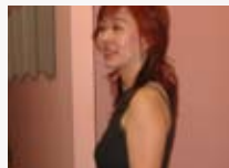
Before: She was wearing the wrong bra that did not enhance her body shape, making her breasts look small and droopy instead.